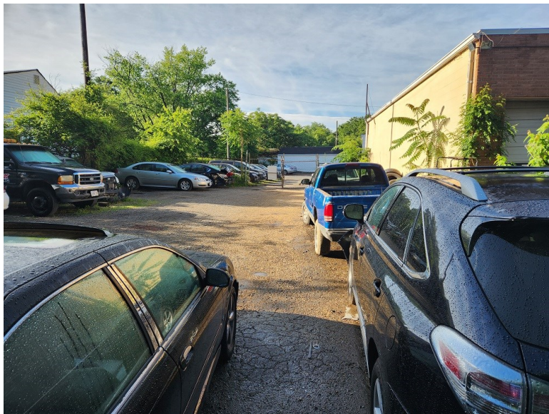
Rear fenced in area